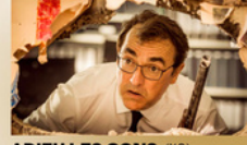
ADIEU LES CONS ('19)