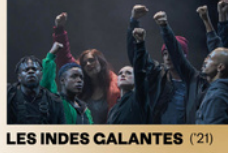
LES INDES GALANTES ('21)